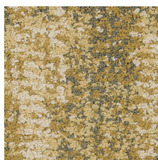
Golden 35210 LRV 29.7